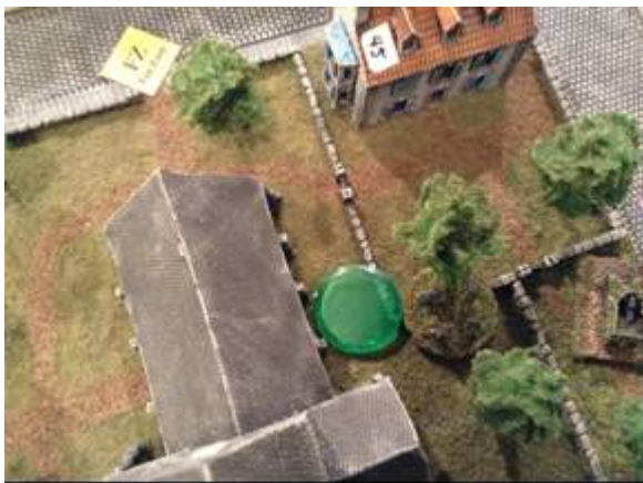
Green German squad moves toward #2 SPG

All the movement momentarily surprised the squads looking in that direction. Both the green and veteran squads took casualties, but FW Haas's group made it uninjured. Because both units passed through the fire zone at the same time, damage was randomized.