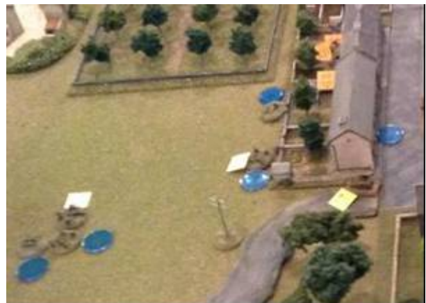
1 st Platoon moves toward the west side of town