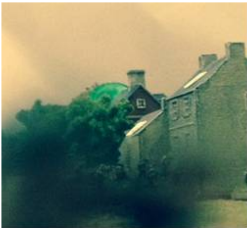
View from 1 st Platoon mortar team.